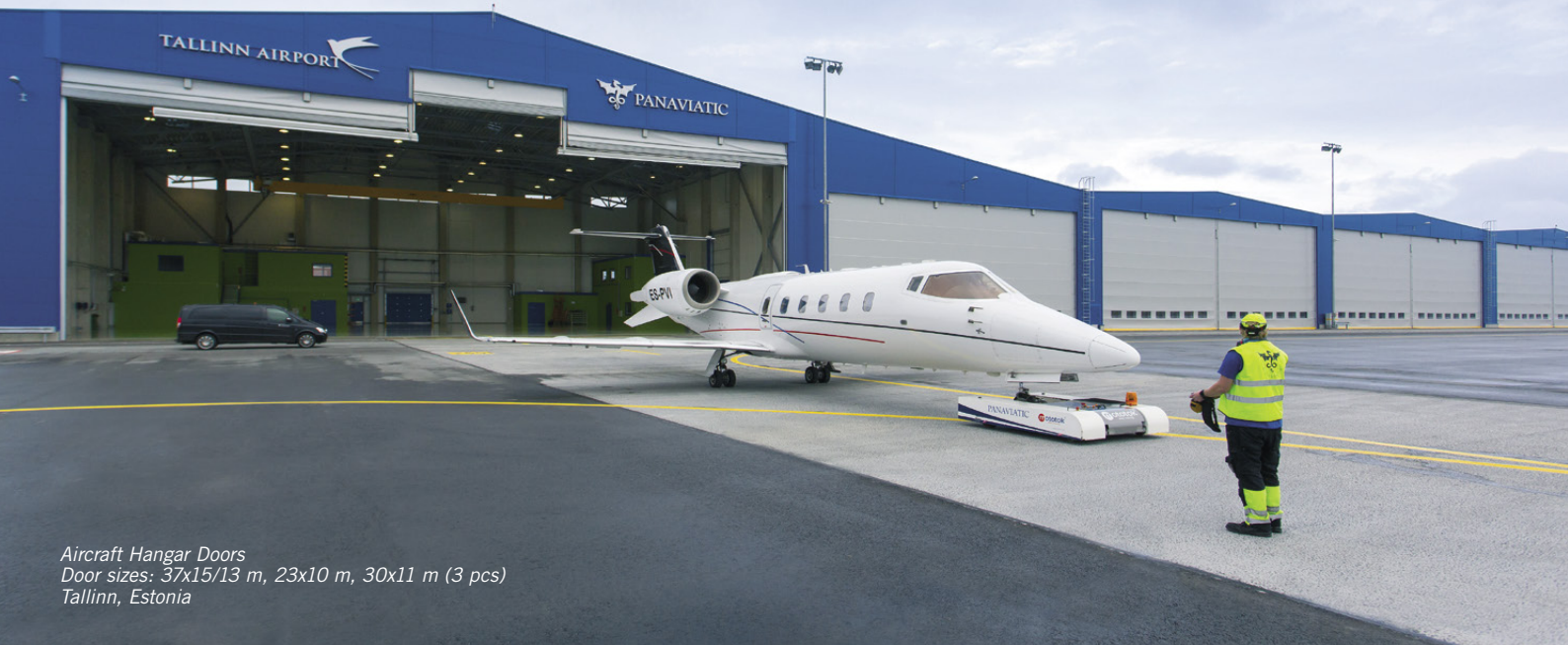
Aircraft Hangar Doors Door sizes: 37x15/13 m, 23x10 m, 30x11 m (3 pcs) Tallinn, Estonia

The innovative multi-leaf door system design with swing-up mullions permits to manufacture the door according to the aircraft fleet shape, with maximum space utilization.