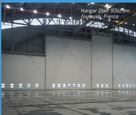
Hangar Door 93x29m Toulouse, France