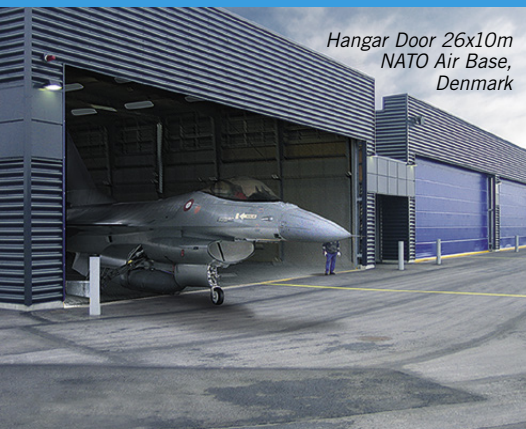
Hangar Door 26x10m NATO Air Base, Denmark

White RAL 9016, Beige RAL 1001, Yellow RAL 1003, Red RAL 3002, 3011, Green RAL 6000, Dark green RAL 6005, Light blue RAL 5012, 5015, Blue RAL 5005, Dark blue RAL 5002, Grey RAL 7035, 7037, 7038, 7024, Brown RAL 8016, Black RAL 9011 and translucent